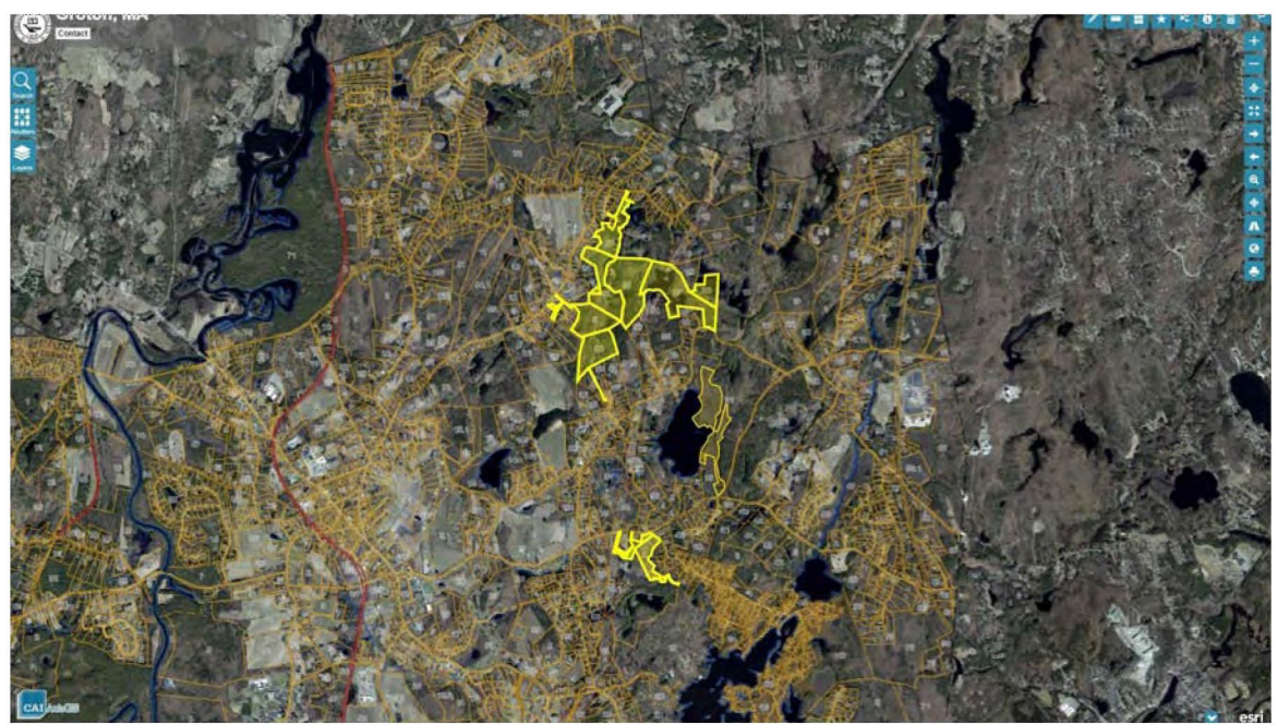
Bundle of properties DFG is proposing to hold CRs on. Article 21 #1-13 authorize CRs.

DFG is willing to hold the CRs on the three properties shown above if they are included in a bundle with other land so that the overall ecological value is higher. An additional nine parcels are proposed to be added, all already conservation lands.