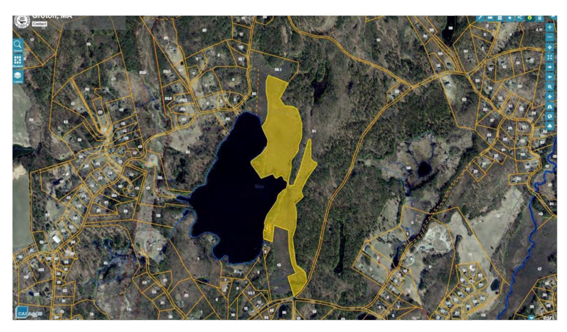
Baddacook Pond East Shore Conservation Area, parcel 243-31.1. Article 21 #10 authorizes CR.