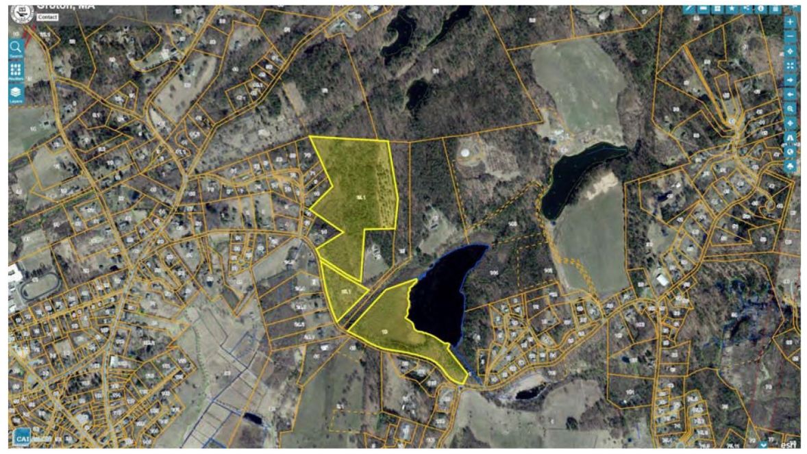
Priest Family and Martins Pond Conservation Areas, Martins Pond Road, parcels 224-15.1 and 224-18. Article 21 #14 and #15 authorize CR.