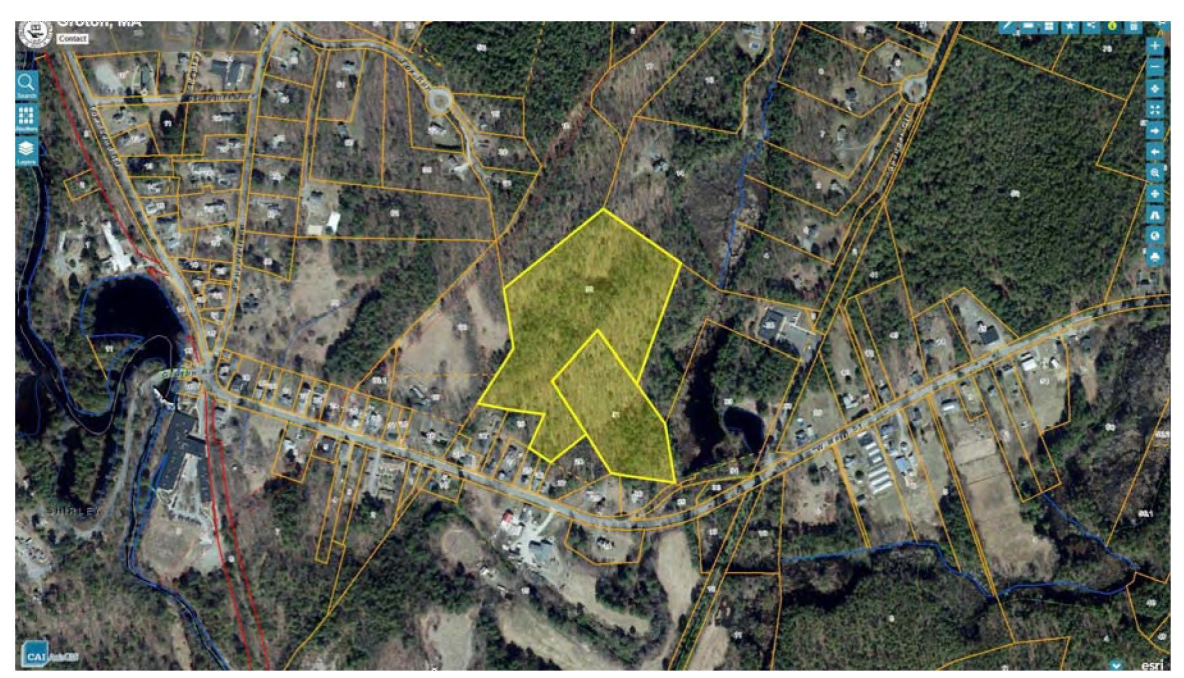
Patricia Hallet Conservation Area, off of West main street west of senior center, parcels 106-31 and 106-32. Article 21 #16 and #17 authorize CR.