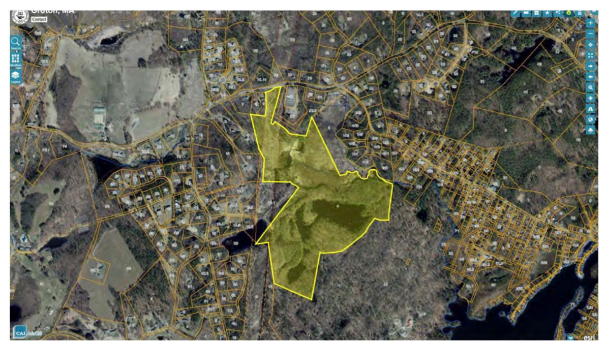
The Brown Loaf parcel, east of Gay Road, north of the Grotonwoods baptist camp, parcel 234-04. Article 22 authorizes granting CR, then transferring to Conservation Commission.

The Brown Loaf parcel was originally purchased by the town in 1999 for general municipal use. Since then, it has been considered for several purposes, including a site for the high school and affordable housing. None of these worked out due to difficult topography and many wetlands interspersed throughout the site.