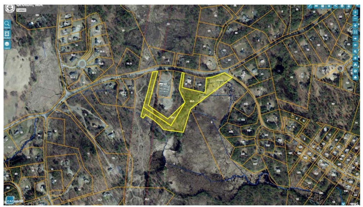
Fucillo Conservation Area, south of Route 40 between power lines and Lost Lake Drive, parcels 233-98.1 and 233-98.2. Article 21 #11 and #12 authorize CR.